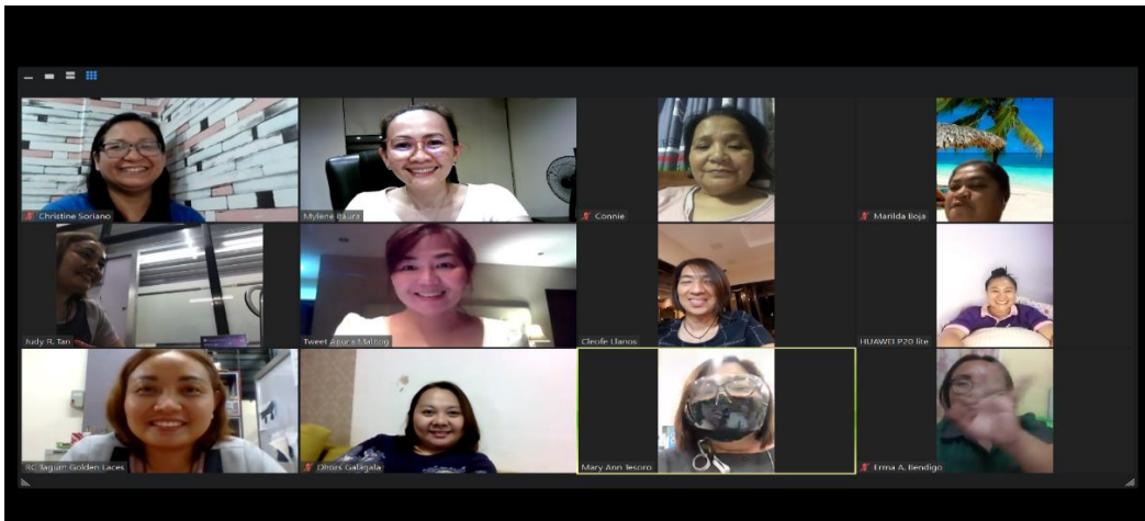
BOD Meeting 5 March 2021