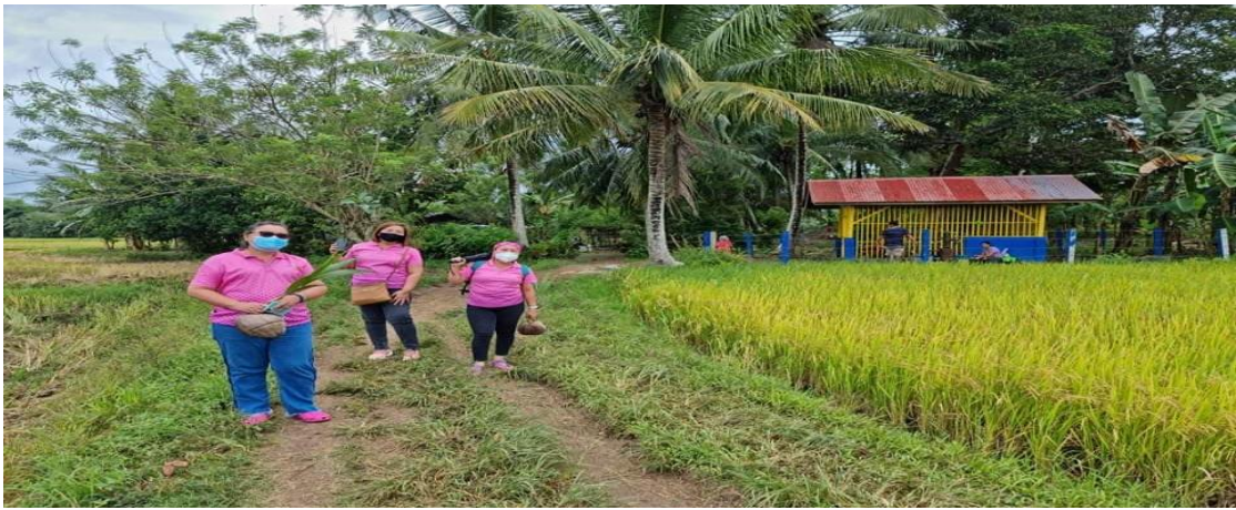
Patubig sa Humayan Project Monitoring 27 March 2021