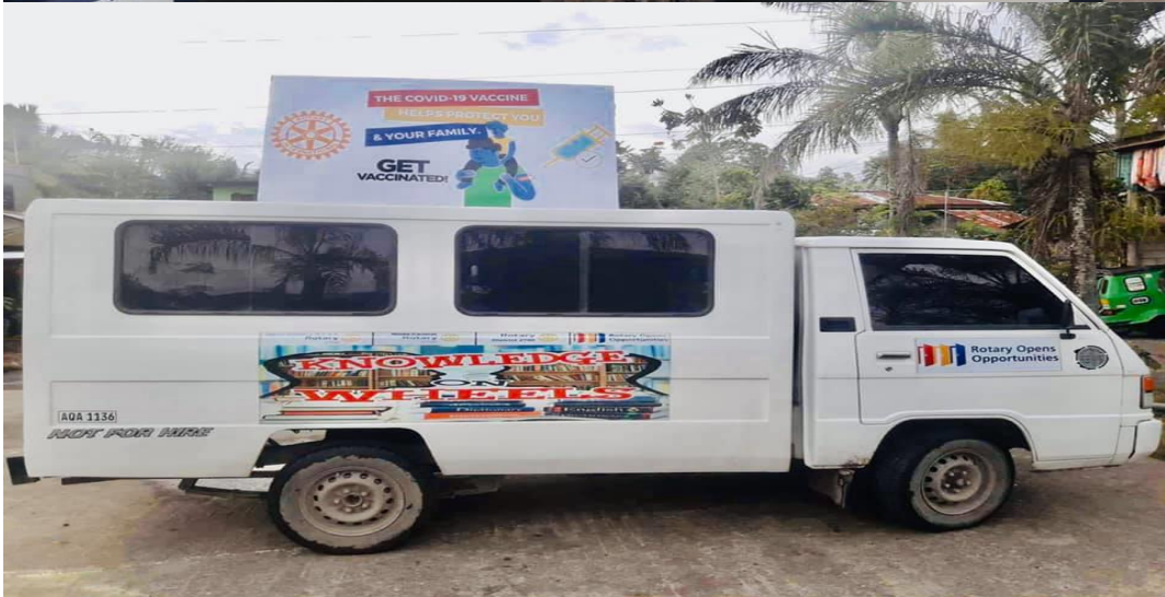
Get COVID Vaccinated campaign ads