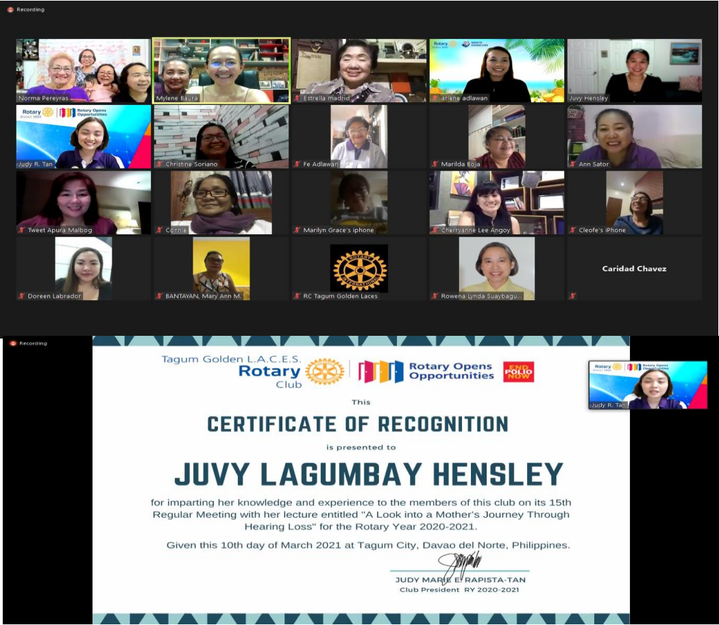
15th Virtual Meeting 10 March 2021