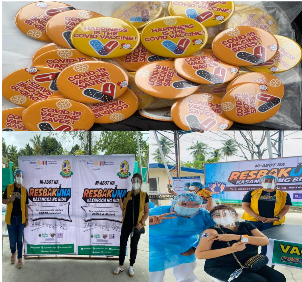
Covid-19 Vaccination-Resbakuna Distribution of Button Pins 11 March 2021